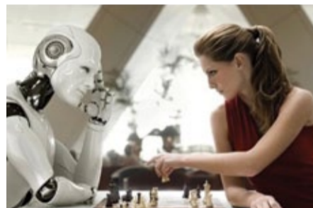
▲ Picture of a person playing chess with AI

Technology has been developing since the appearance of the human race and is still going on in present days. The industrial revolution took place in the 18th century, where it brought huge convenience to the entire world. Today, developments made in the 21st century are considered as "The digital revolution". Diverse kinds of machines and technologies have appeared which turned out to be quite useful and helpful to us. However, out of all developments made in digital area, AI (an acronym of Artificial Intelligence) is certainly the most interesting development made by humans. Although it might have benefits and harm, benefits definitely seem to shine.