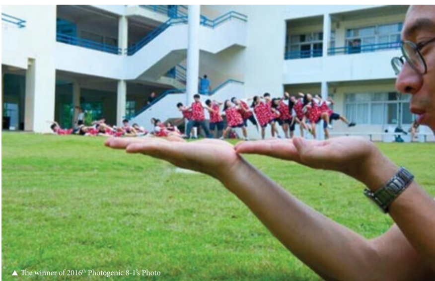
▲ The winner of 2016 th Photogenic 8-1's Photo

Pizza for winners - making memories with classmates