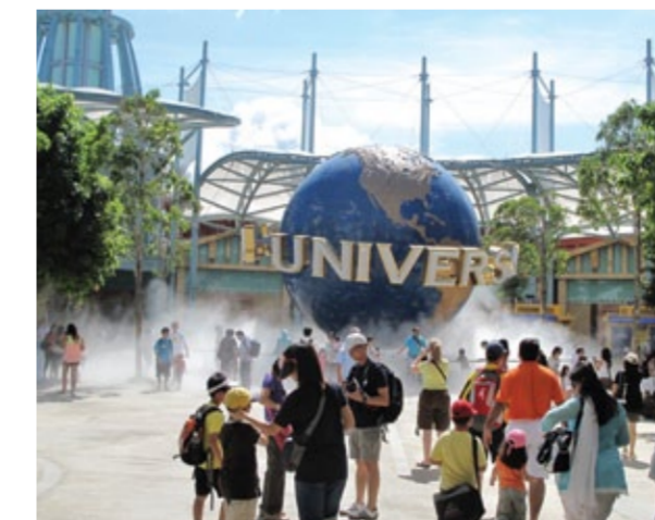
▲ The students all enjoyed their third day in Singapore in the Universal Studios.

Next day, students had a meaningful time, getting to know about one of the greatest colleges globally, the NUS (National University of Singapore) through campus tour with its Korean students' guides. After that, they visited the Jurong Bird Park and the Botanic Garden.