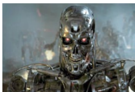
▲ One scene from the movie "Terminator"

humanity and try to control us. Who knows? The movie 'Terminator' might